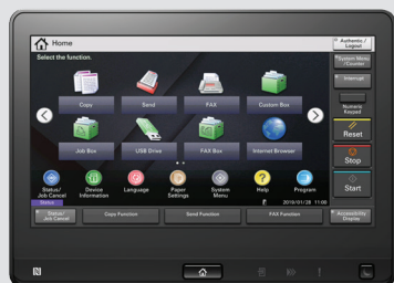
New 10.1" touch-screen