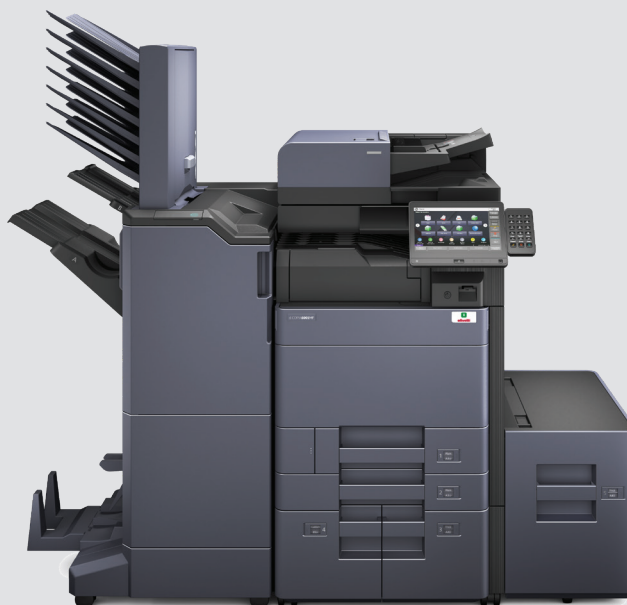
d-Copia 6001MF with DP-7110+PF-7110+PF-7120+DF-7110 +BF-730+MT-730+ NK-7120