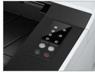
LED operator panel PG L2535