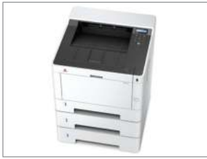
Flexible paper management