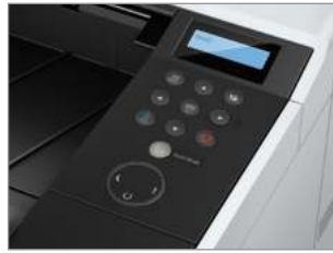
LCD operator panel PG L2540