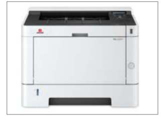
Compact and easy to manage